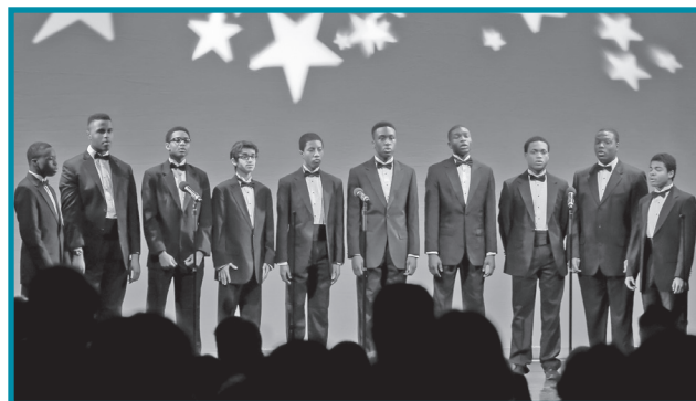
The Men's Ensemble from Talent Unlimited High School perform the National Anthem.