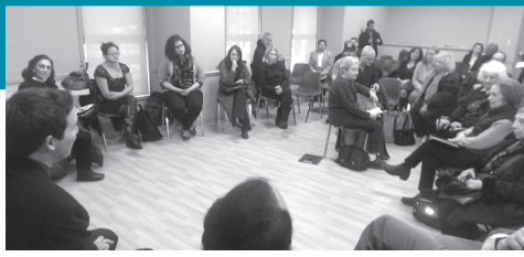
Discussing important issues in our neighborhood at my inaugural First Friday event, which drew fifty people.

Join me for "First Friday" every month from 8:00AM - 10:00AM at my office on 244 East 93rd Street. This is a chance for me to meet you in person to discuss what's important to you and how to make our neighborhood a better place to live. The first event was a great success and I look forward to many more. Contact our office to RSVP.