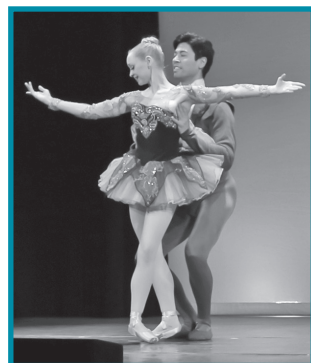
Ballet Dancers of Dances Patrelle perform Yorkville Nutcracker