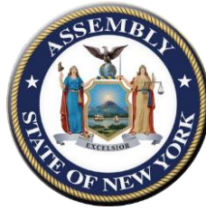
THE NEW YORK STATE ASSEMBLY