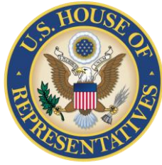
UNITED STATES HOUSE OF REPRESENTATIVES